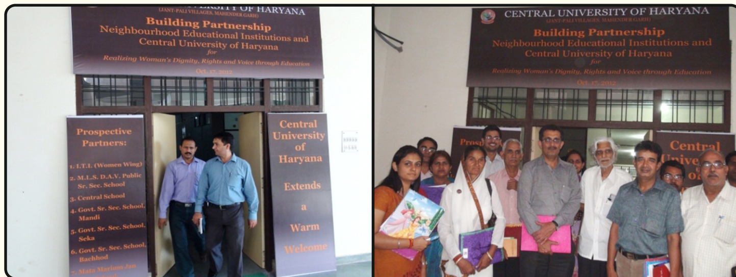
(Delegates participated in Meeting held on Oct., 17, 2012)