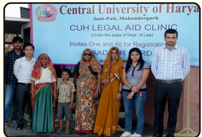
CUH Legal Aid Clinic volunteers