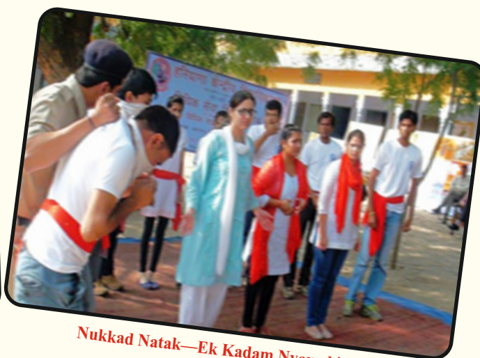
Nukkad Natak—Ek Kadam Nyaya ki Aur...