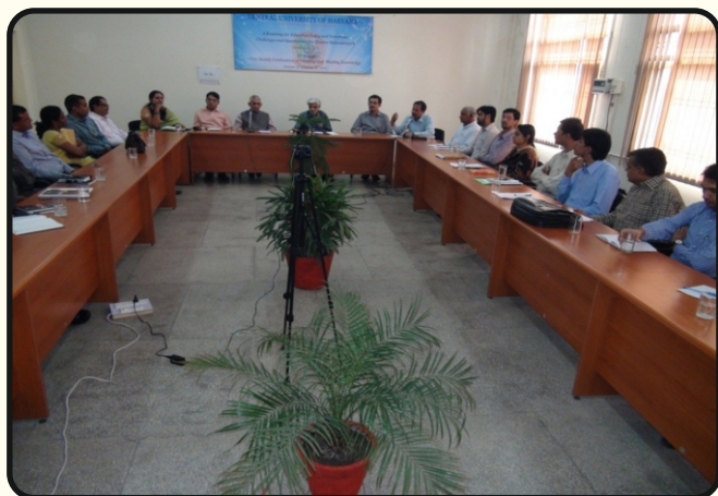
A Scene from 'A Roadmap for Education Today and tomorrow: Challenges and Opportunities for District Mahendergarh' on November 8, 2012

CUH Legal Aid Clinic from the date of its inauguration is open to the public at large for serving the cause of the society. Number of people have taken the benefit in form of legal assistance from the Clinic.