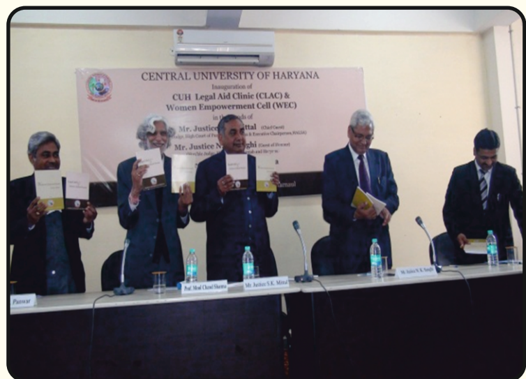
Release of Monograph “Legal Aid & Inclusive Judicial Process”