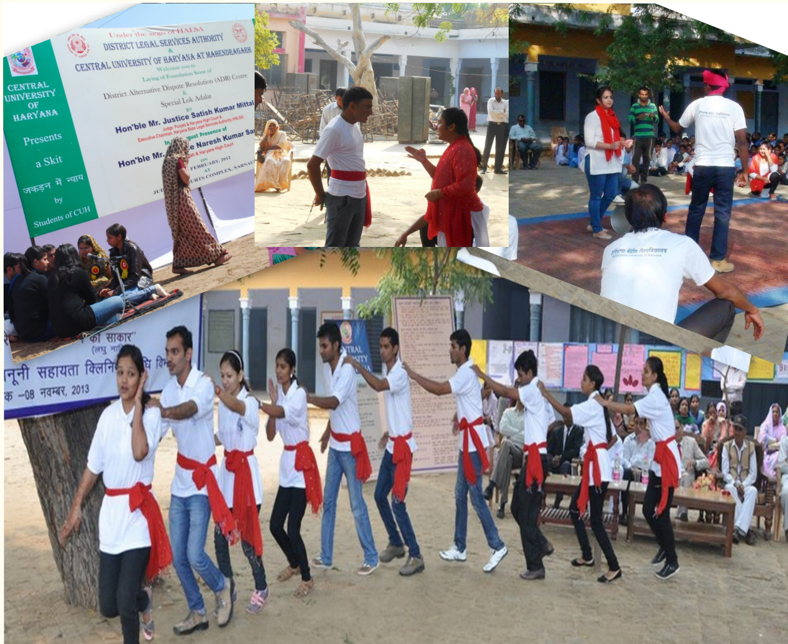
CUH students enacting Nukud-Natak