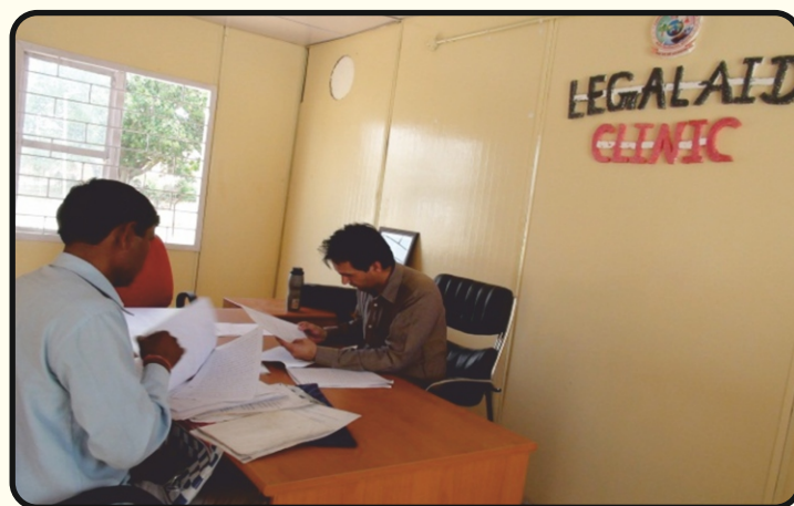
A Scene of Counselling at CUH Legal Aid Clinic