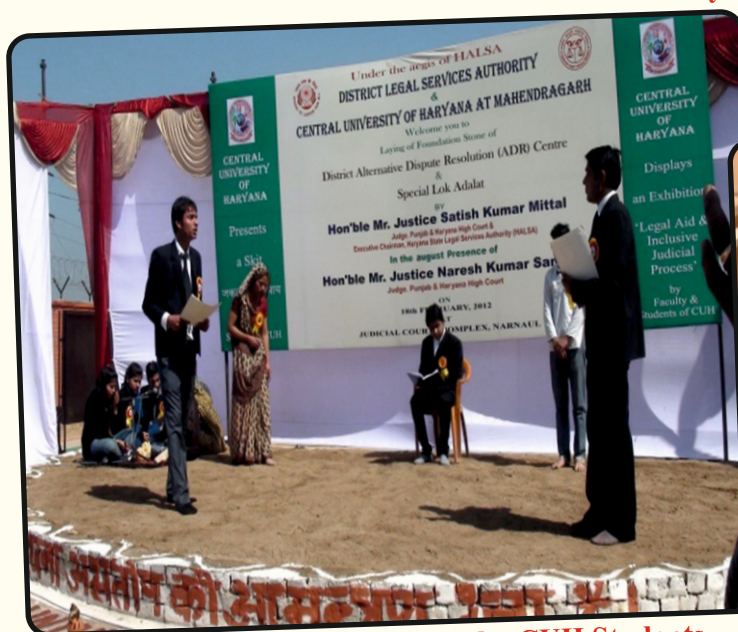
"Jakdan Mein Nyaya"—A Play by CUH Students at Judicial complex, Narnaul