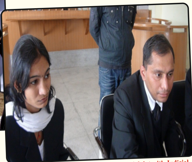
Student of CUH while participating in Lok Adalat with Judicial Magistrate in a panel of Lok Adalat held at District Court, Narnaul