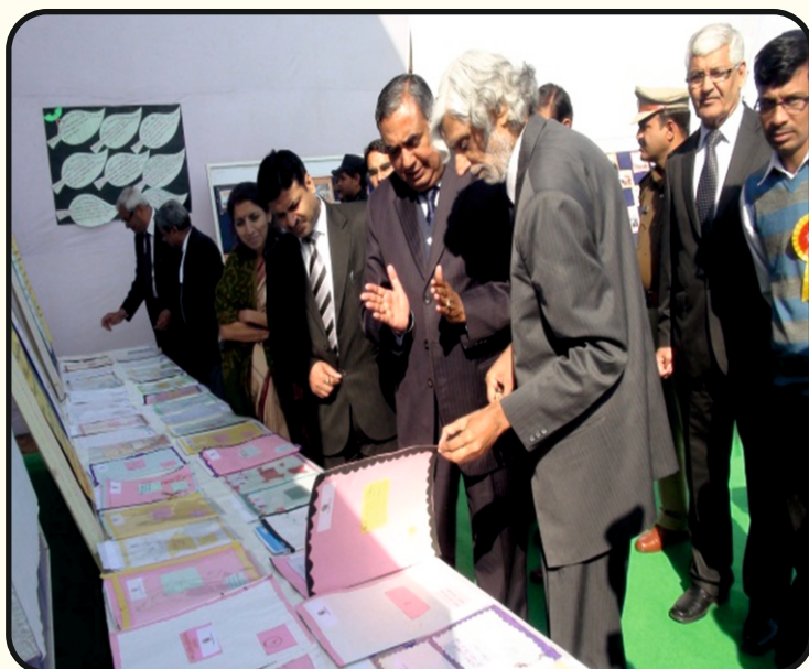
Exhibition of Public Utility Forms at Narnaul Campus