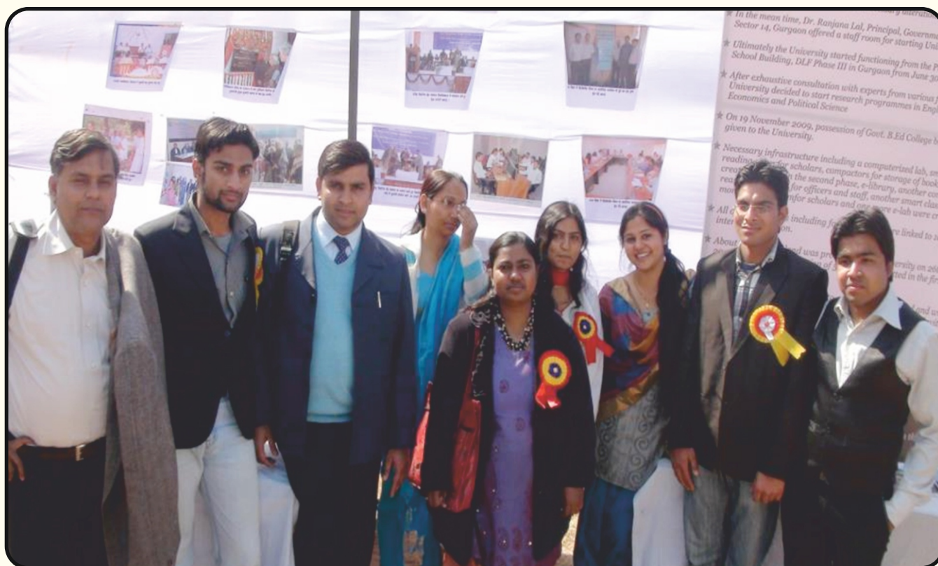
An Exhibition entitled “Inclusive Judicial Process” at Judicial Complex, Narnaul

A grand Exhibition on the theme of 'Inclusive judicial Process’ was displayed at the District Court Complex depicting various dimension of idea of access to justice on 18th February, 2012.