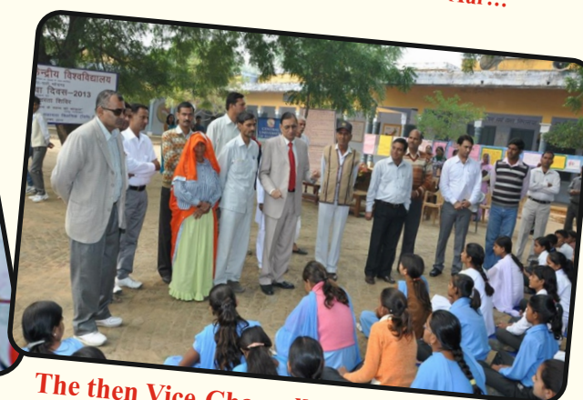
The then Vice-Chancellor interacting with the Govt. School students