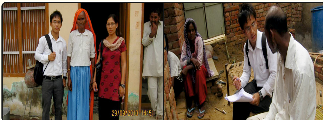
Students on legal literacy survey at village 'Unhani', Tehsil-Kanina, Mahendergarh

Students of Department of Law conducted a Legal Literacy Survey of the 5 villages (Gahda, Jant, Malda, Unchi Bandhor & Unhani,) of District Mahendergarh of Haryana through questionnaires collected from inhabitants of these villages on 29-09-2013 & 30-09-2013. A total number of 20 households were surveyed from each village as sample.