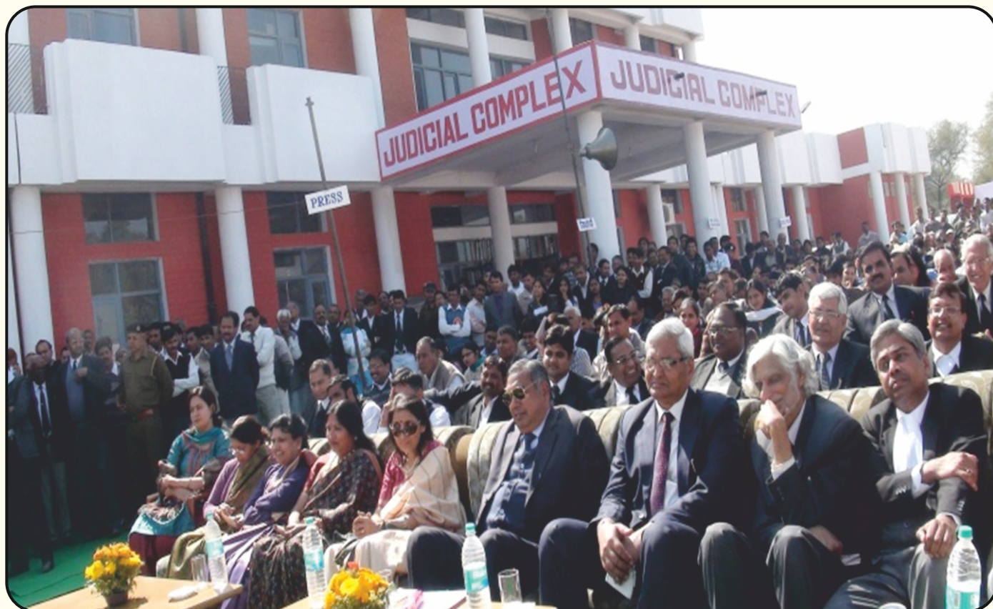
Gathering of dignitaries and target groups at Judicial Complex, Narnaul on the eve of Special Lok Adalat, Exhibition and Play enacted by CUH students