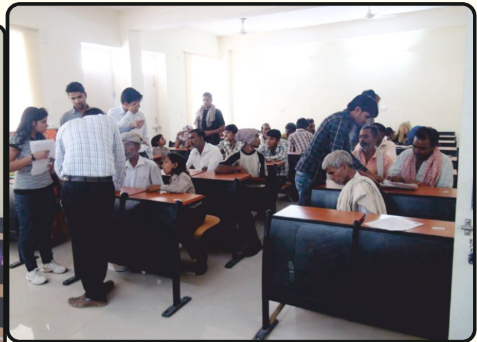
CUH Legal Aid Clinic volunteers helping people in filling up the Registration Form