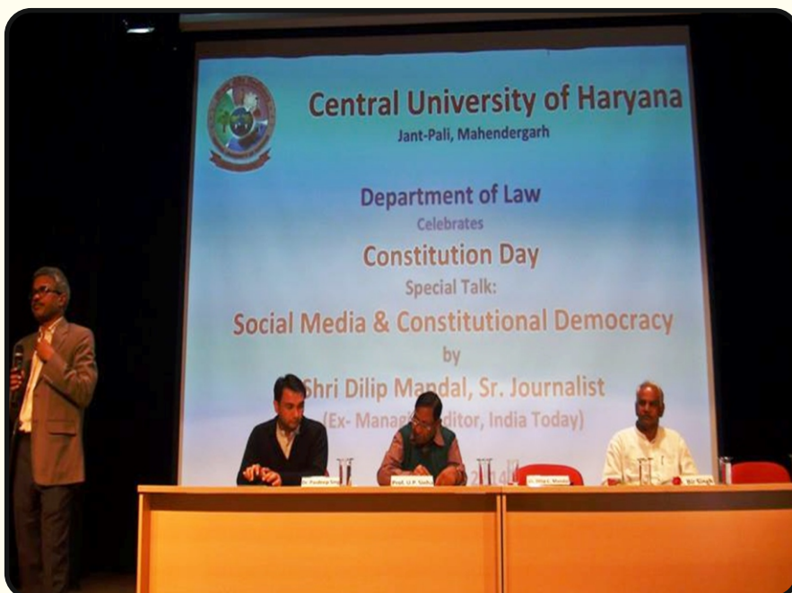
Special Talk: Social Media & Constitutional Democracy on the eve of Constitution Day (26 Nov., 2014)