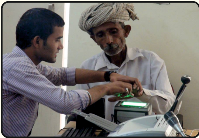
A villager going through registration procedure